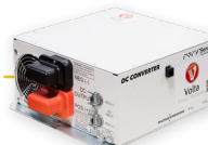
12V DC SUPPLY