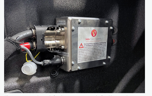
*System mount shown is for demo purposes only. Real integration may look different.